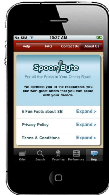
SpoonByte in iPhone